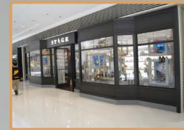
Access Control: Shop