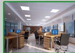
Time Attendance: Office