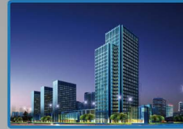
Networked Security: Building