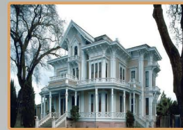
Access Control: House