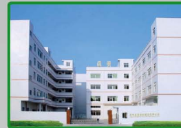
Time Attendance: Factory