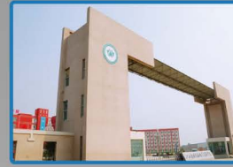
Networked Security: School